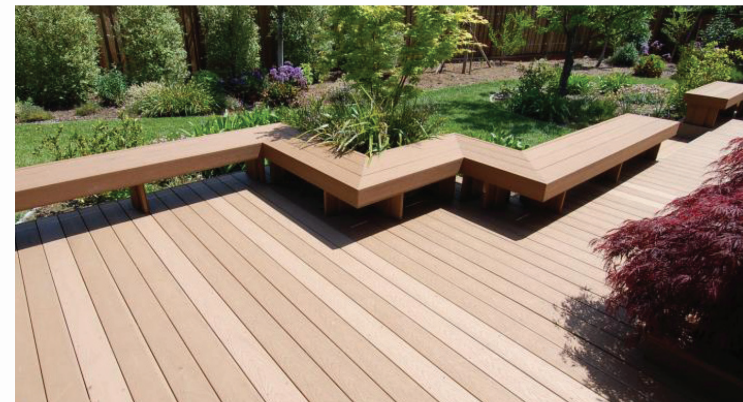
COMPOSITE DECK WITH BENCH