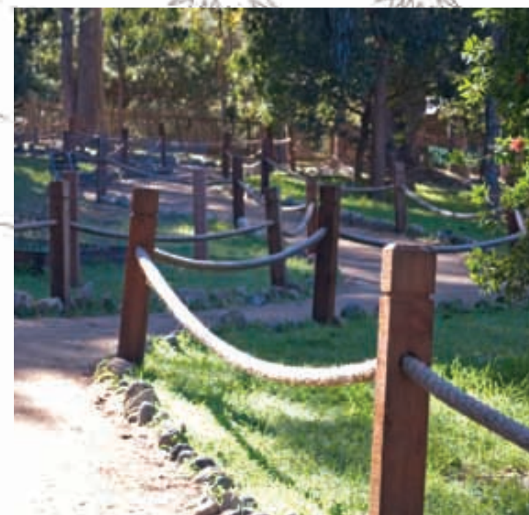
POST AND ROPE BARRIER